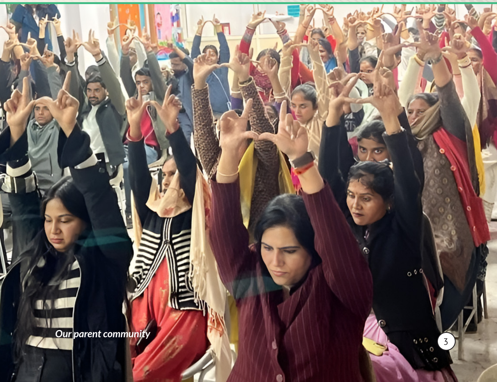
Our parent community