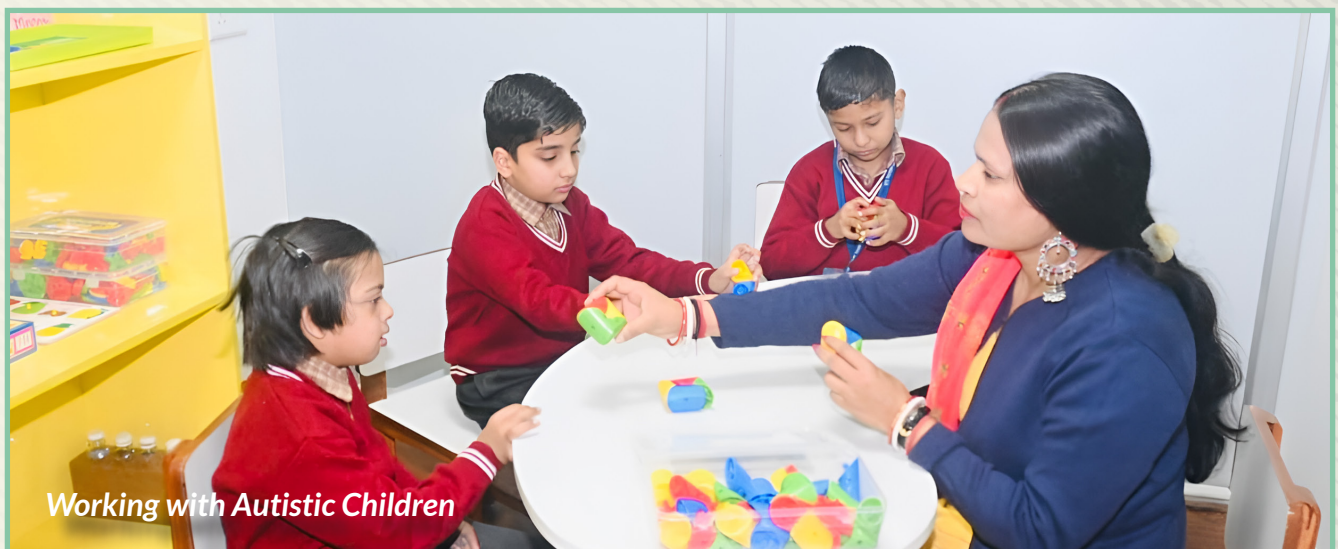
Working with Autistic Children