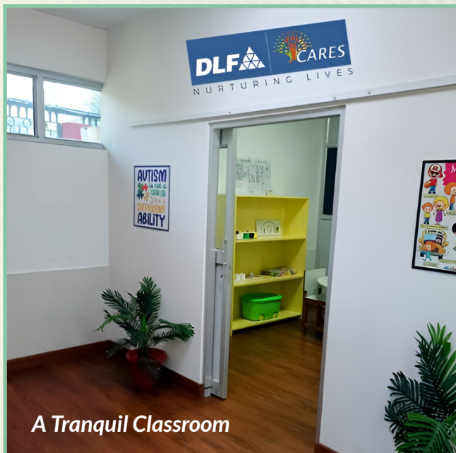
A Tranquil Classroom