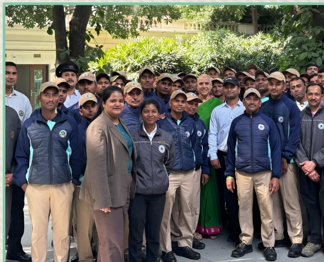
Parents at an awareness campaign for In-school Scholarship

Our team supports parents every step of the way during our in-school scholarship awareness campaigns, from understanding eligibility criteria to navigating the application portal. Our personalised guidance serves as an empowering tool for the parent.