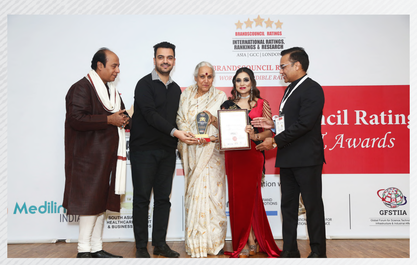
DLF CARES Receives Tech-Enabled International Education Excellence Award 2024

Chairperson and Executive Director - Education, Innovations, and Training DLF QEC Schools, and Scholarship Programmes