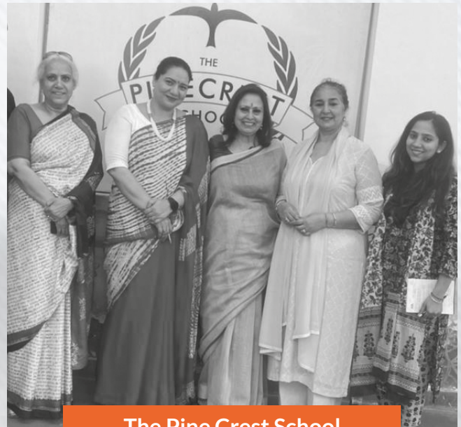
The Pine Crest School