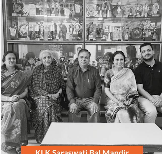
KLK Saraswati Bal Mandir

Showcasing educational alliances with few of our partner schools