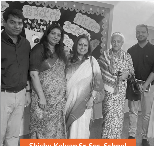
Shishu Kalyan Sr. Sec. School