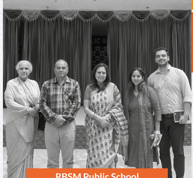
RBSM Public School