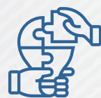
Vocational Education University Connects