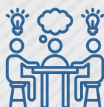
Workshops and Seminars Pan India