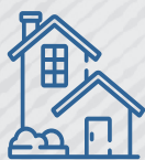
Home Visits of Scholars Partner Schools

Chairperson and Executive Director Education, Innovations and Training DLF FOUNDATION SCHOOLS AND SCHOLARSHIP PROGRAMMES