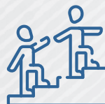
Guidance and Mentorship Support