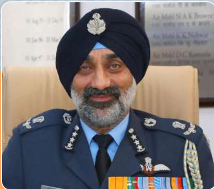
Air Marshal Amarpreet Singh, the newly appointed Chief of the Indian Air Force, is an alumnus of SBM Senior Secondary School