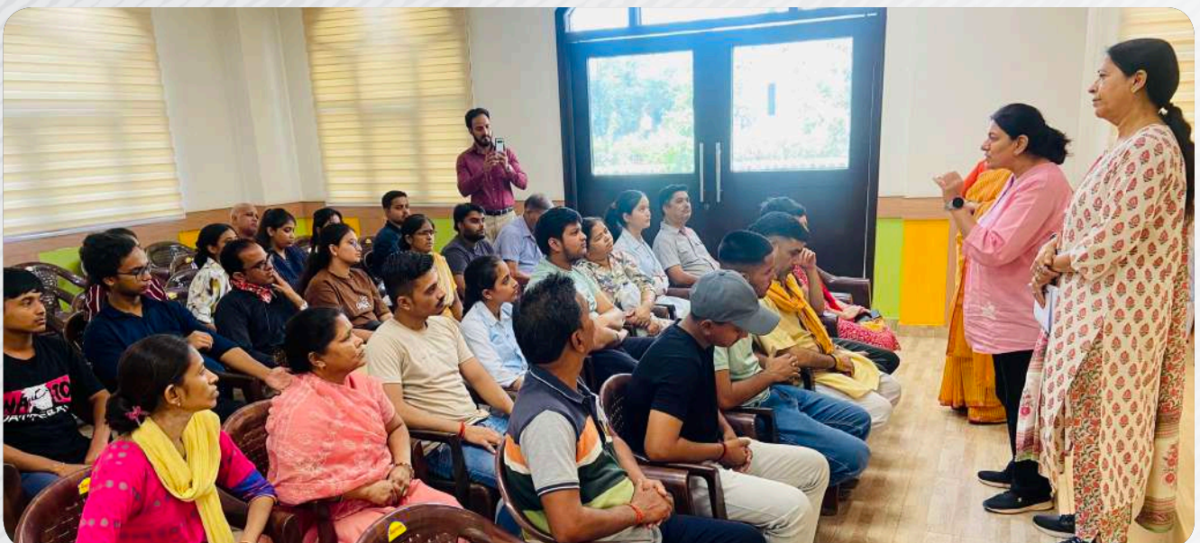
Interacting with Parent Communities